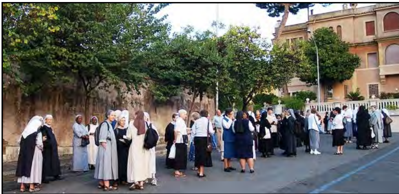
Leaving for Subiaco