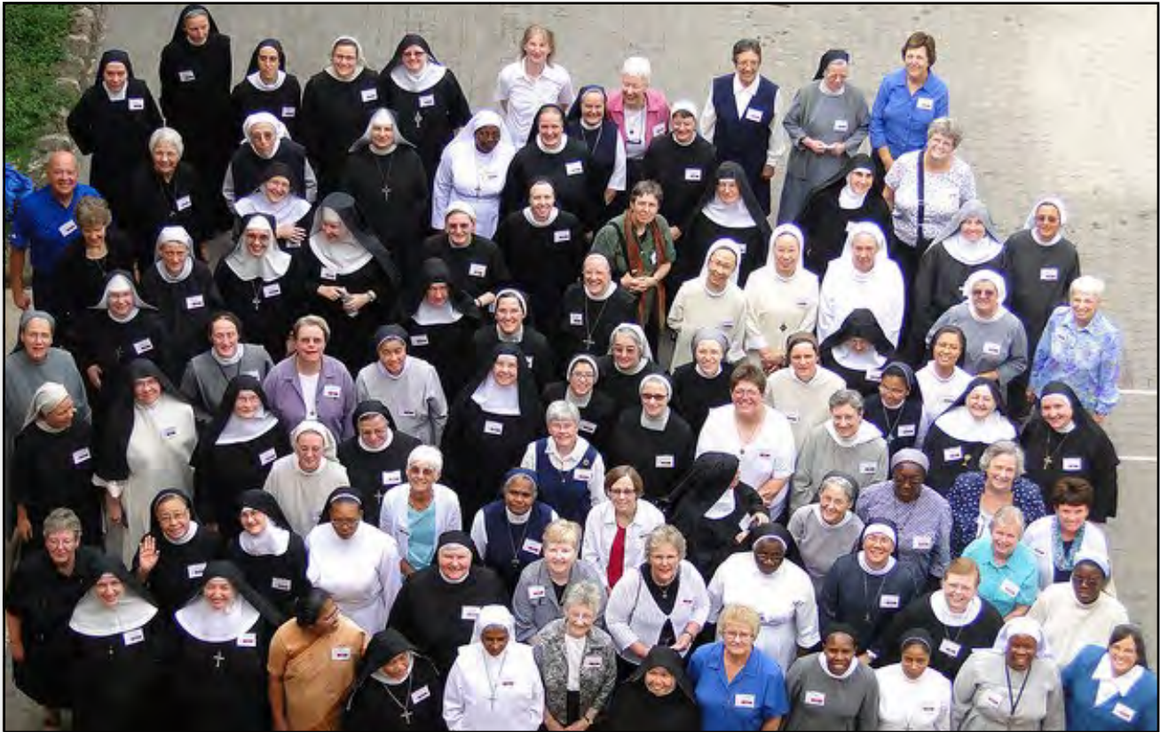
2014 Symposium Participants by Regions