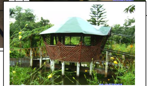
The Missionary Benedictine sisters of Manila - a meditation room on "ecology farm" (above and right) and working in the slums (left).