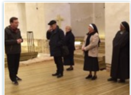
Tour of Sant Cecilia

Benedictine Monasteries are noted for their love and appreciation of art in its various forms. Art often serves as a meditation. Our visit to Sant Cecilia Church and the Institute of Art featuring the artist, Sean Scully, was an experience of art and beauty. We learned of the history of Sant Cecilia dating back to C.900 up to the present. Since 2005 Sean Scully played an important role as creator of paintings that adorn the Church. The Church is imbued with his own personal style. For further information go to: www.santaceciliamontserrat.com