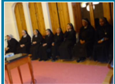
Meeting with Sisters of the Monserrat Community